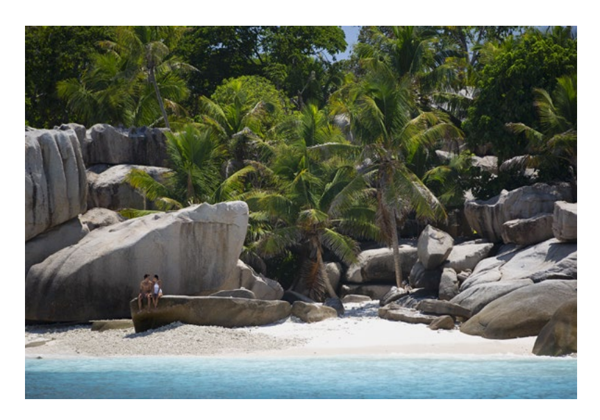
Half Day - 4 hours starting at €460 for 2 persons Mix and match the best of both worlds and spend half a day discovering the island of Curieuse and snorkelling around Coco Island. *Price excludes landing fees

Full Day - 7 hours starting at €635 for 2 persons Enjoy a full day island hopping, discovering both the underwater and dry land beauty of Seychelles. Organise your day with the concierge and plan a visit to Curieuse, La Digue, and some snorkeling time around Coco Island.*Price excludes landing fees