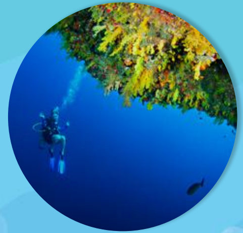
DIVER PROGRAMME Suggested age: 10-14 years

The marine world awaits with exciting adventures taking place at our underwater restaurant as well as the nearby islands where you'll get a chance to swim alongside turtles and identify a number of colourful ocean creatures.