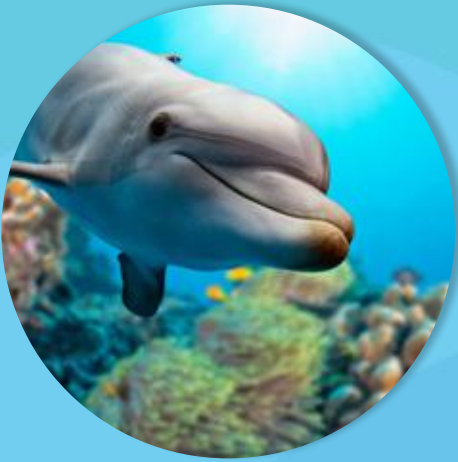
DOLPHIN PROGRAMME Suggested age: 4-8 years