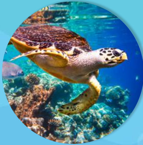
TURTLE PROGRAMME Suggested age: 8-12 years

Immerse in fun displays and a range of activities, including helping the marine biologist spot dolphins in the sea and learning to snorkel at our beautiful house-reef.